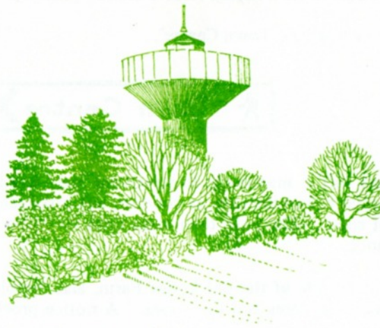
The Water Tower - Headless Cross

The water tower will now be straight ahead and serves as a convenient landmark on your journey. Follow the path to the right along the chain link fence and playing fields and past Ipsley Primary School. If you wonder about the houses clustered up on the hill to the right, they are part of the Greenlands Estate.